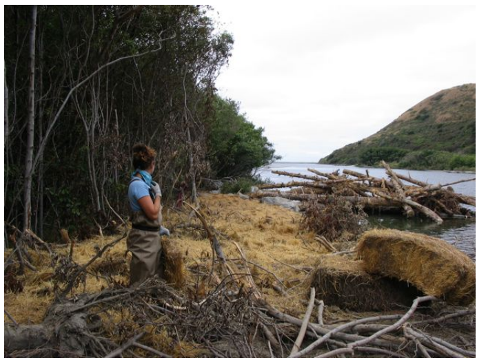
Figure 4 Mulching disturbed sites after construction