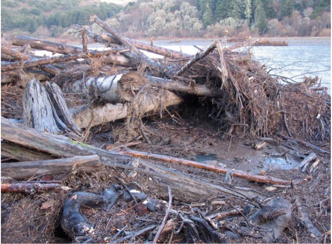
Figure 6 LWD structure #5 after flows

All project sites were observed and photographed throughout the winter to observe effects of flow and structure integrity. Our observations showed complete structural integrity of LWD structures, and a large accumulation of woody debris (see Figure 6 and Error! Reference source not found. Figure 7)