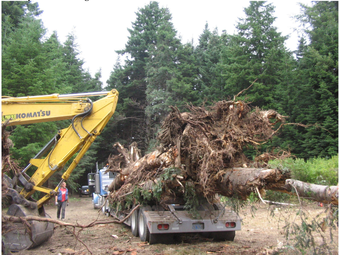
Figure 1, Low-bed ready for haul to Project Deck A

The excavator dug around each tree for harvest and pushed them over. Rootwads and 50 foot lengths of logs were decked at the acquisition site and then loaded and hauled to the project deck A. At the project deck a loader was on standby to unload logs.