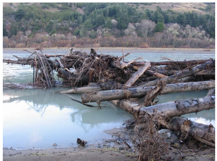
Figure 7 LWD structure #6 after flows