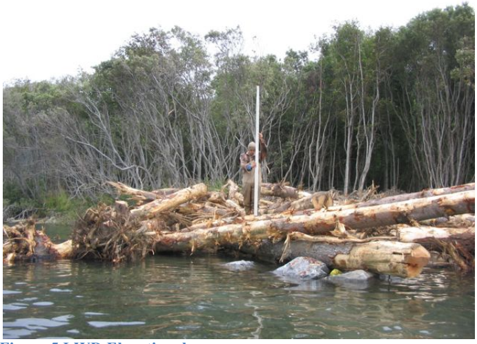
Figure 5 LWD Elevational survey

All project sites were observed and photographed throughout the winter to observe effects of flow and structure integrity. Our observations showed complete structural integrity of LWD structures, and a large accumulation of woody debris (see Figure 6 and Error! Reference source not found. Figure 7)