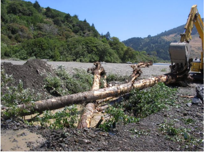
Figure 3 Apex jam under construction

Design and placement of the Apex jams was performed in cooperation with USFWS engineer Connor Shea.