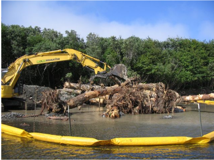
Figure 2 LWD structure #5 under construction

The excavator removed the road-bed, native straw was used to mulch the site and the excavator moved to construction of the Apex Jams (see Figure 4).